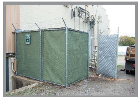
Panels were made for two of the walls of this enclosure, with a separate panel for the door.