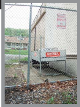
Machinery noise can be an extremely annoying problem. Any noise source that is set onto a concrete slab and backed with concrete block is going to sound many times louder than it actually is due to the reflection of all of the noise in one direction. In order to fix this problem, a line of sight barrier must be constructed and it is strongly advised to introduce some absorption onto the reflective surface of the building "behind" the machine.