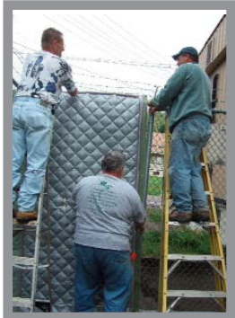
For this installation, the chain link fence surrounding the unit was moved away from it to allow for adequate air flow. Please contact your local HVAC service person to make sure that if you install an enclosure around your machine, it will not have a restricted airflow. Once the fence was installed, final measurements were taken and the panels were fabricated. The installers held the panels to the fence by using exterior grade zip-ties through the grommets that were installed across the top, middle and bottom of the panels during manufacturing.