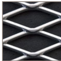
Chrome Metal Charcoal Insert