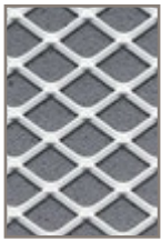
White Metal Light-Gray Insert