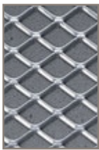
Chrome Metal Light-Grey Insert