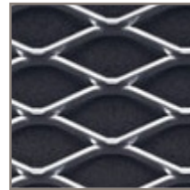
Chrome Metal Charcoal Insert