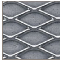
Chrome Metal Light-Grey Insert