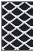
White Metal Charcoal Insert