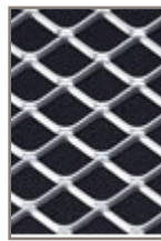
Chrome Metal Charcoal Insert