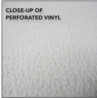
CLOSE-UP OF PERFORATED VINYL