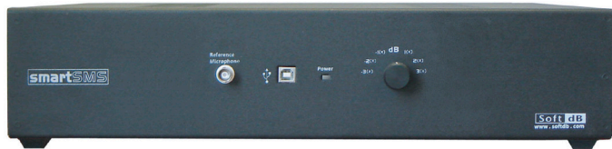
SMS-AMP Front Shown