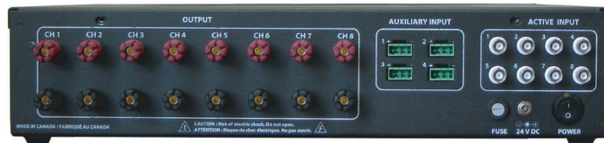
SMS-AMP-8 Back Shown