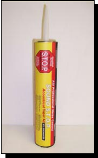
Part # STOPADA-29....29 oz PSAA-29

We Identify and S.T.O.P. Your Noise Problems