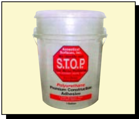
Part # STOPADAG-1G....1 gallon PSAA-1G5G